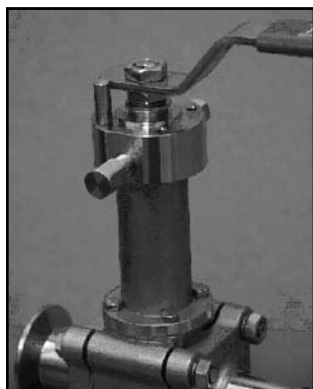
Stem extension for 1/2" – 1-1/2" MK9020

The extension stem manual is intended to be used in conjunction with the valve manual as a guide to assist customers in the installation and maintenance of the enclosed extension stem option for Steriflow MK 9020 2-Way and MK9030 3-Way Series ball valves.