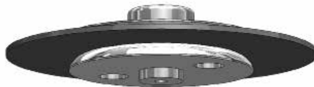
Figure 1: Diaphragm Subassembly