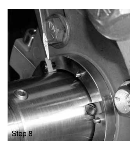
Step 8 Pry off the centering devices with a screwdriver.

Step 9 Connect the flush line to the gland if required.